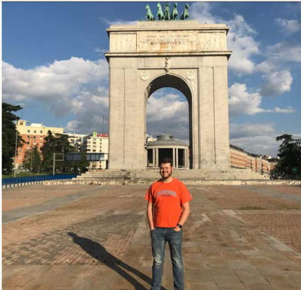
Dean's List Fall of 2018

My highlight was serving as a first-year resident advisor on campus this past year. I am finishing up a two-month Spanish immersion program in Madrid, Spain. Next year I will be an RA in Seaside and holding office for the executive committee of Delta Sigma Pi.