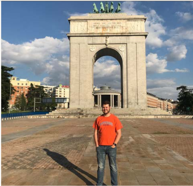
Dean's List Fall of 2018

My highlight was serving as a first-year resident advisor on campus this past year. I am finishing up a two-month Spanish immersion program in Madrid, Spain. Next year I will be an RA in Seaside and holding office for the executive committee of Delta Sigma Pi.